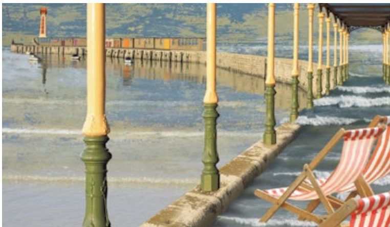
Scene - Unseen | Claire Gill 28 June - 21 July 2013